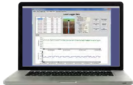
LevelLink PC Application

The LevelLine is set up using the LevelLink PC Software, LevelLine Meter or Quick Deploy Key. A variety of logging types are available these include Linear, Event Based, Schedule, Future Start, Future Stop, Deployed Start and Real Time View.